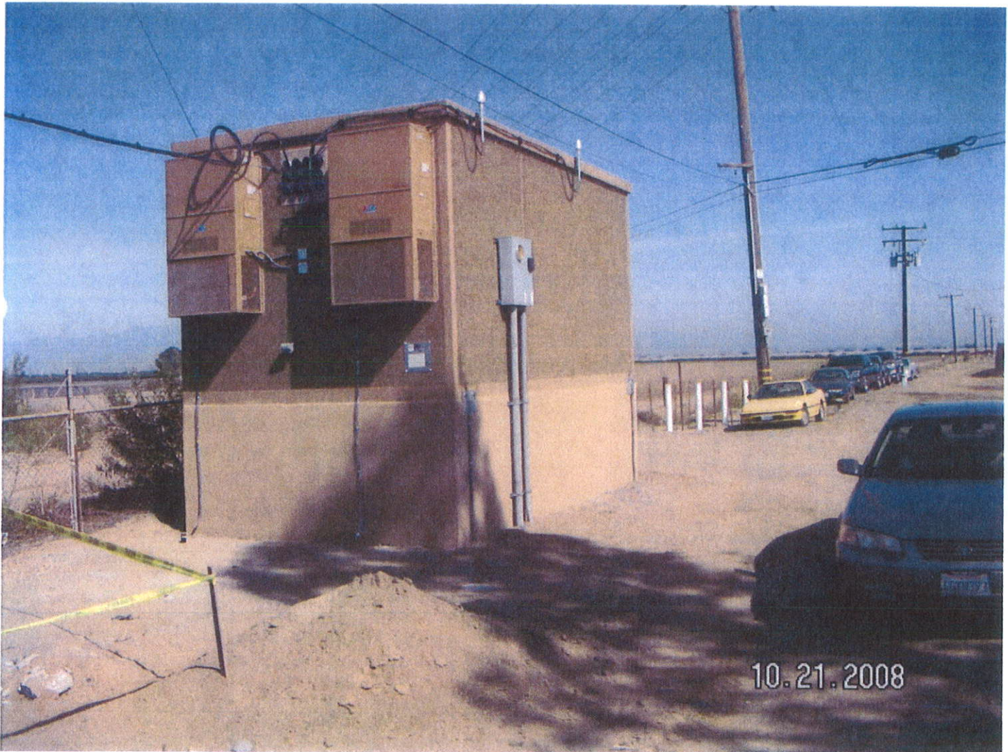
REAR VIEW, Dated October 21, 2008