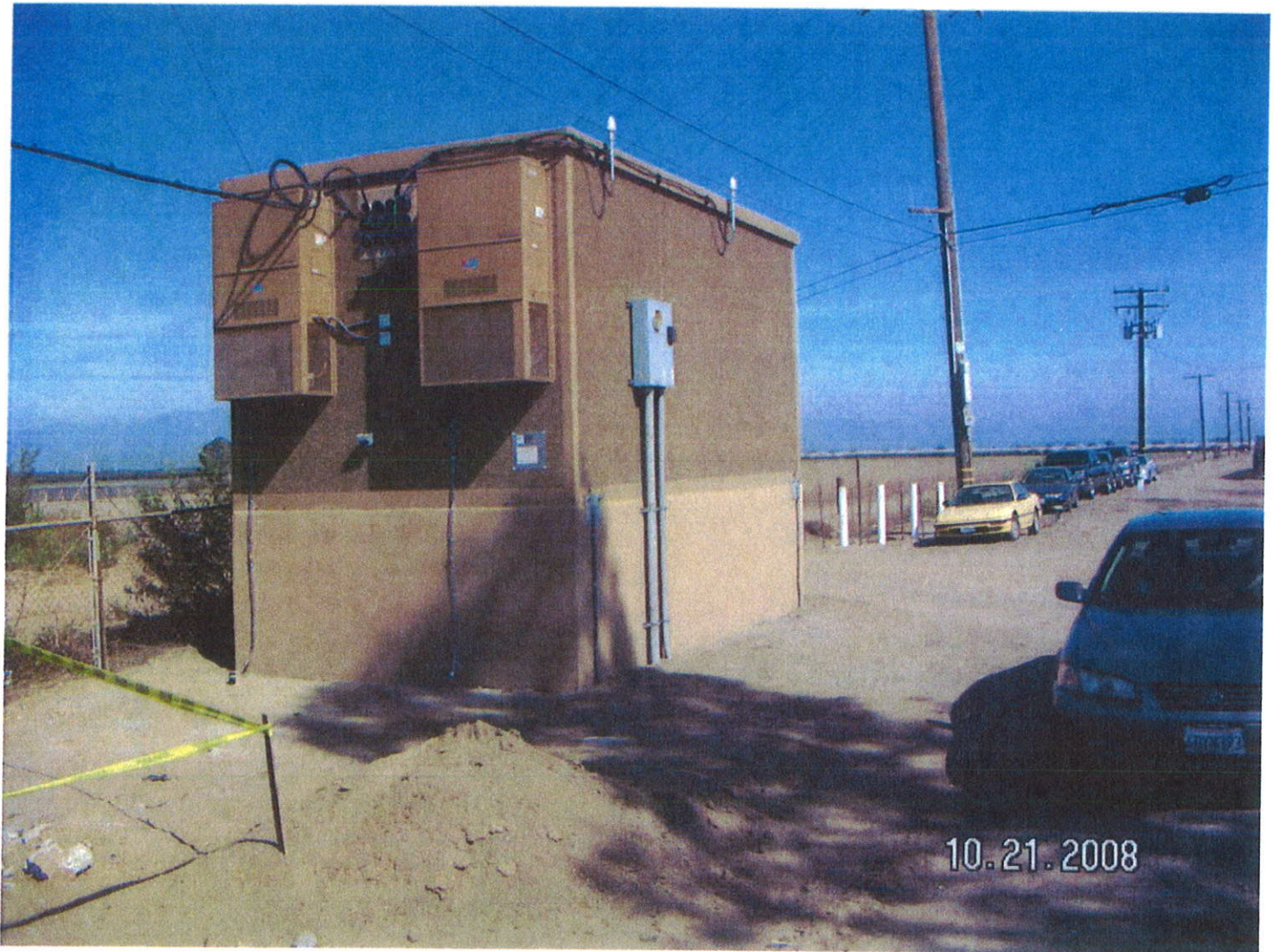
REAR VIEW, Dated October 21, 2008