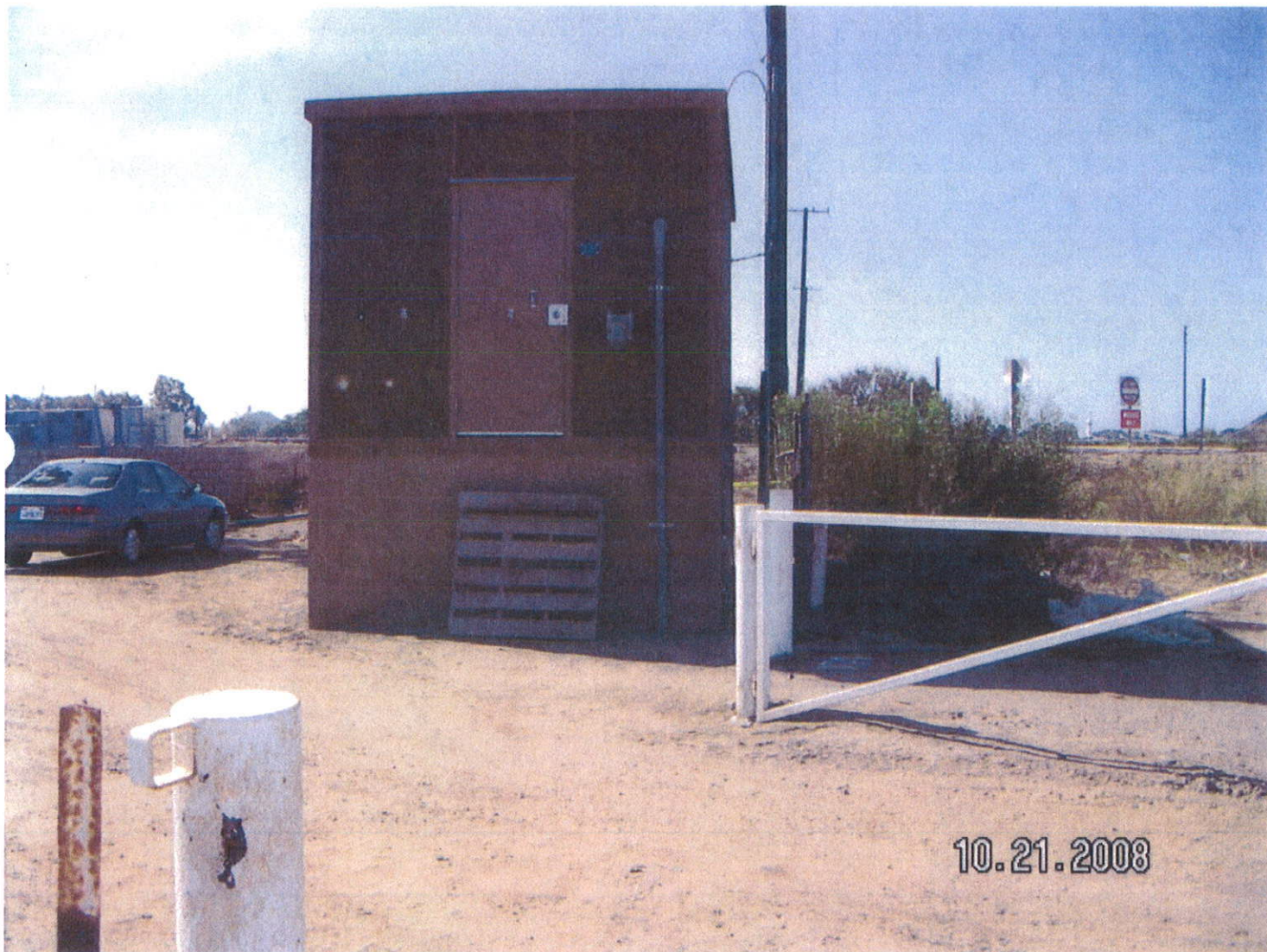
FRONT VIEW, Dated October 21, 2008

If submitting more photographs than will fit on the preceding page, affix the additional photographs below. Identify all photographs with: date taken; "Front View" and "Rear View"; and, if required, "Right Side View" and "Left Side View."